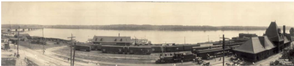
Mississippi River, Keokuk, Iowa, 1907 , from U.S. Panoramic Photos, 1851-1991