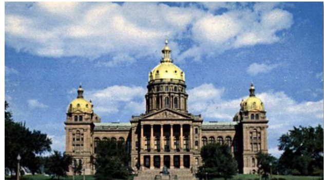
State Capitol, Des Moines, Iowa, from U.S., Historical Postcards .

From 1671 through 1689 the Iowa region was claimed for France by Sieur Saint-Lusson, Daniel de Greysolon Sieur de Luth (Du Luth), Robert Cavalier Sieur de la Salle, and Nicolas Perrot. Several jurisdictional changes occurred in Iowa's early history. France ceded Iowa to Spain in 1762, although it was returned in 1800 preceding the Louisiana Purchase in 1803, which made it United States territory. As part of the United States, Iowa was first included in the Illinois Territory (1808) and then the Missouri Territory (1812). Migrating groups from the states began the first settlements in 1832. Before statehood was established in 1846, these settlements were included in the Michigan Territory (1834), Wisconsin Territory (1836), and finally its own territory in 1838.