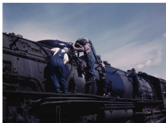
C. & N.W. R.R., women wipers employed at the roundhouse cleaning one of the giant "H" class locomotives, Clinton, Iowa, from the Library of Congress Photo Collection, 1850-2000

Visit the Ancestry.com Learning Center at www.ancestry.com/learn .